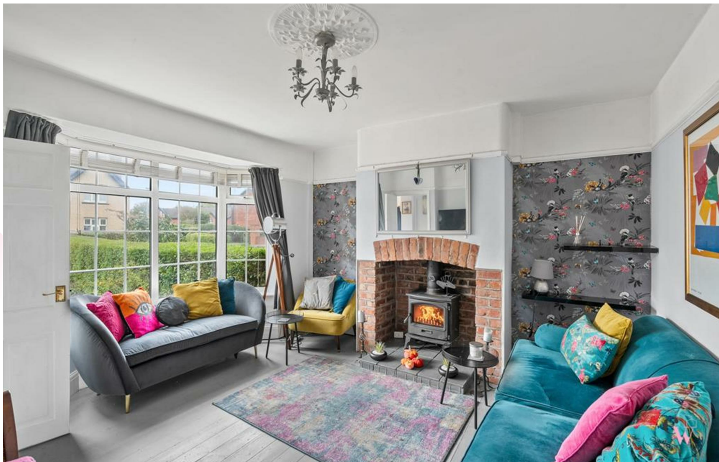
Hartford Road, Davenham, Northwich CW9 8JP